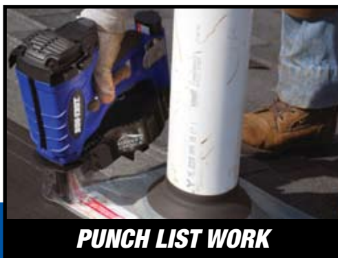
PUNCH LIST WORK