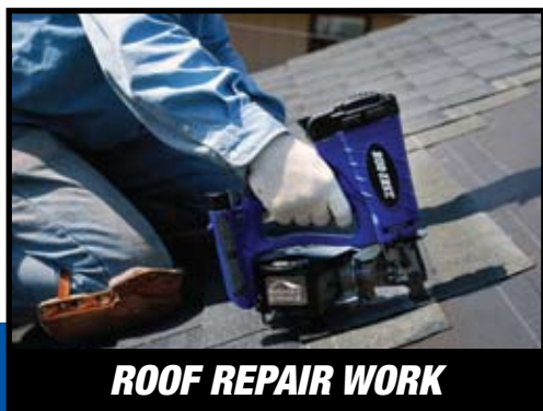
ROOF REPAIR WORK

THE BATTERY POWERS THE IGNITION AND FAN. A FULLY CHARGED BATTERY DRIVES 2,200 NAILS. EACH DUOFAST BRAND TOOL COMES WITH TWO BATTERIES. THIS IS EQUAL TO APPROX., 6 SQUARE.