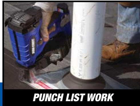
PUNCH LIST WORK